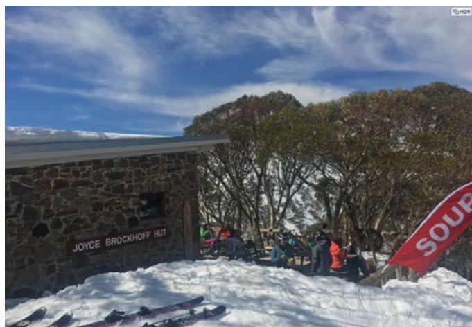
Snow sports enthusiasts enjoying their refreshments on the deck in the sun

After years of deterioration the hut was declared dangerous in the 1990s. In 1997 the building underwent extensive renovation, roof repairs and expansion to include the tiered deck. The funds for works were donated by a number of the Hotham Ski Clubs and the Mount Hotham Tow Co.