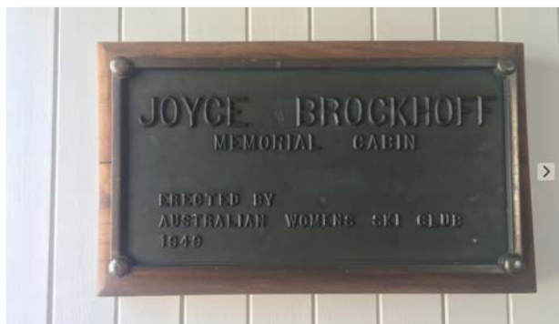
The plaque on the newly painted door

The hut was designed by Geelong architects Buchan Laird & Buchan, and was one of the first built in the Mount Hotham area. It is constructed from locally quarried stone, and features fabulous picture windows. It officially opened in 1949.